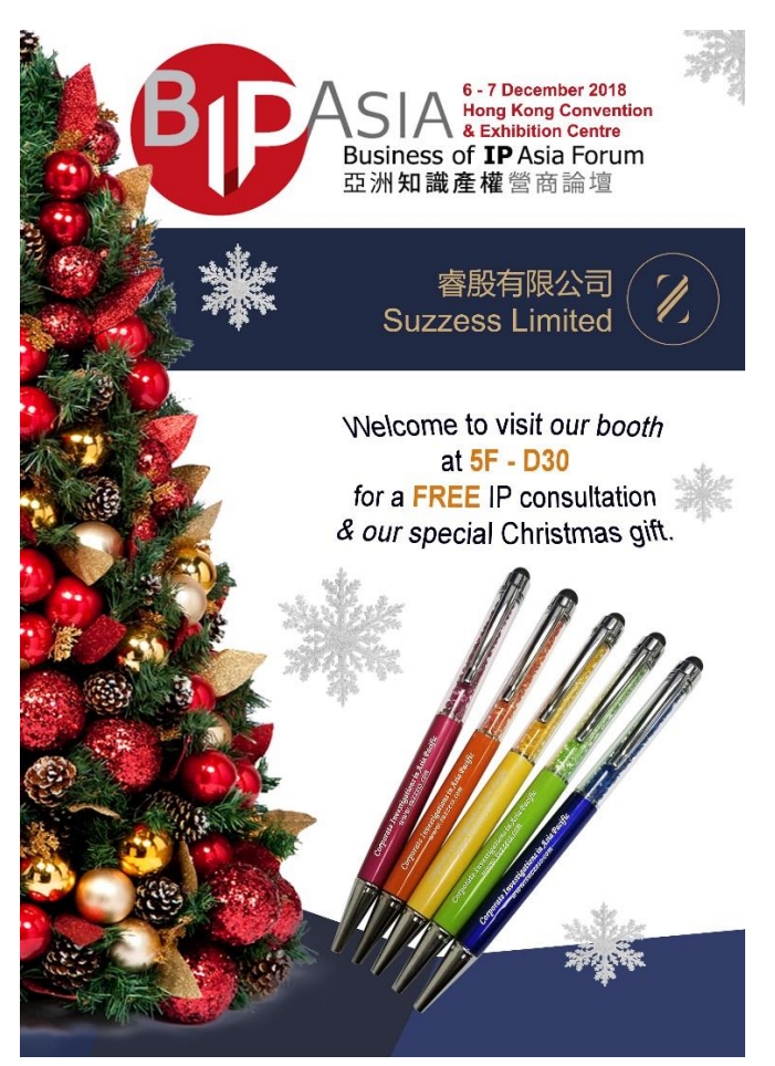
Suzzess Limited | 2018 | Newsletter 3

Innovation in the New Socio-technological Landscape" attracted over 2,500 local and overseas visitors, which shows that Hong Kong is an important regional IP trading hub.